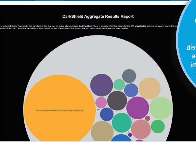
Figure 2 – Aggregate results report for sensitive data discovery in IRI DarkShield

RowGen provides synthetic data generation. It emphasises the customisation of test data, giving you fine-grained control over what, how and where your data is generated. For instance, it can generate test data using parameters you provide to it (including which class of data it should belong to) or select data randomly from one or more "set files" that have been prepared ahead of time, creating a holistic data profile for a person or other entity that does not exist but that has realistic attributes drawn directly from your data. Moreover, this extends past just what data you are generating and also encompasses how and where you are generating it (which means that you could, say, generate test data within a CI/CD pipeline).